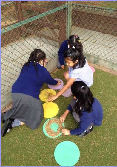
OUR CHILDREN CREATE LEARNING OPPORTUNITIES FOR THEMSELVES AT BREAK TIMES