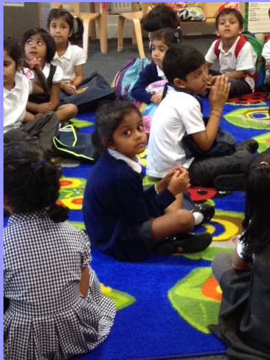
OUR RECEPTION CHILDREN HAVE SETTLED IN WELL