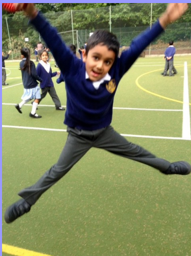
JUMPING FOR JOY AT PLAYTIME

I WISH I KNEW..... each month this section will include information about school procedures, policies and practice.