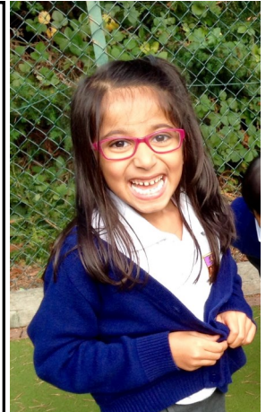
HAPPY CHILDREN AT AVANTI HOUSE PRIMARY SCHOOL.